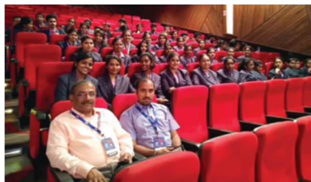
Faculties and students participating in the annual management convention of KMA